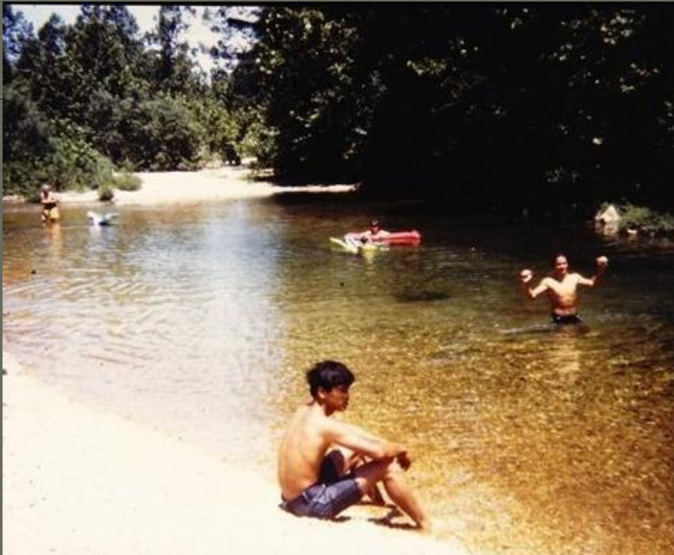
“Granddaddy Swimming Hole” – Outside Bunker MO on the West Fork of the Black River