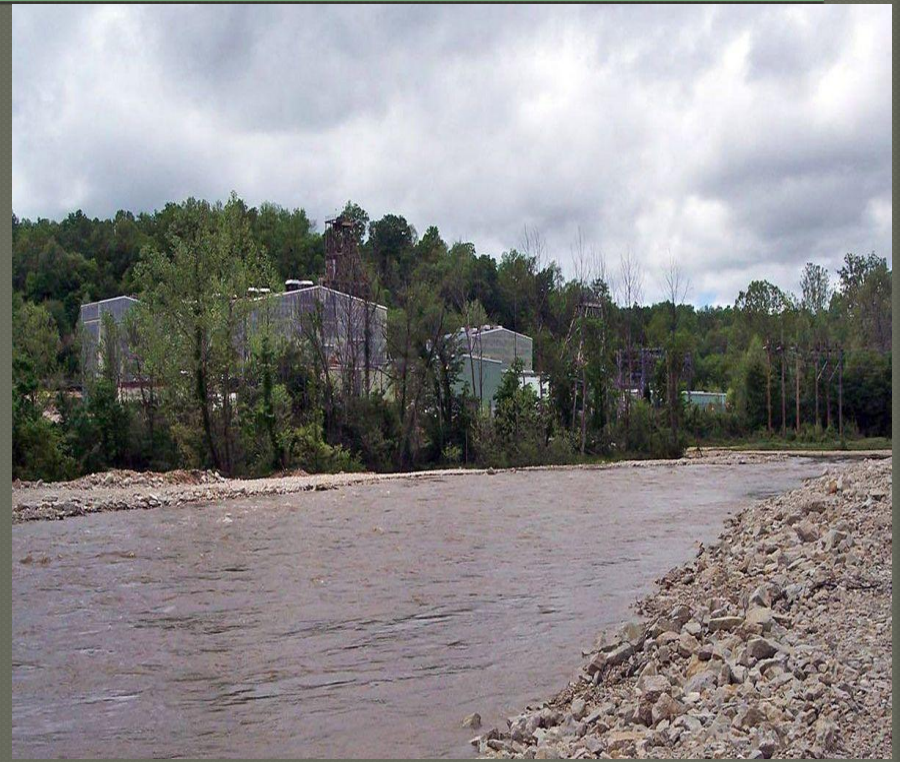
The Re-Routed West Fork River Channel