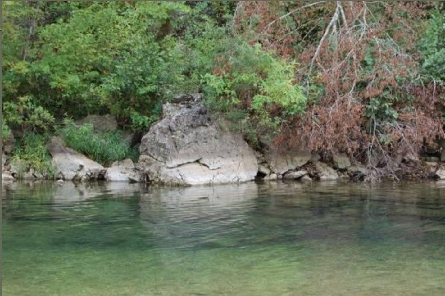
“Sutton’s Bluff” – Outside Centerville MO on the Black River