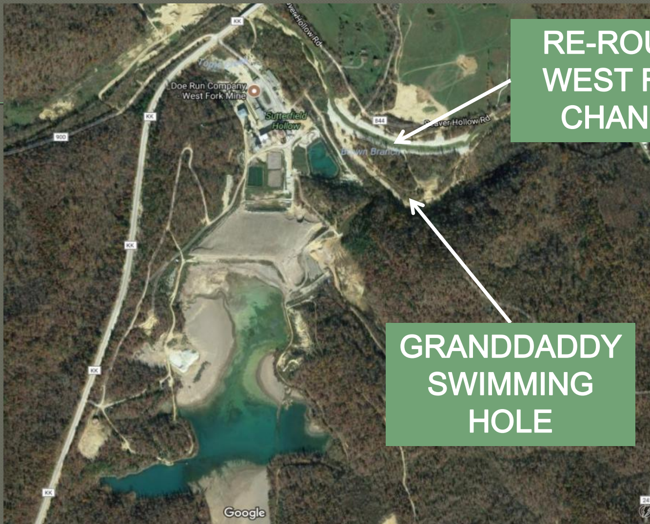
DOE RUN WEST FORK MINE FROM SPACE